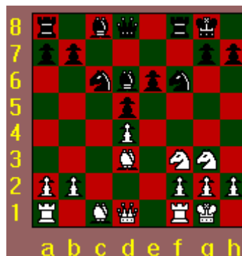
Position 4: Black to play